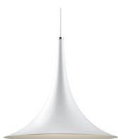
Trion 45 P1