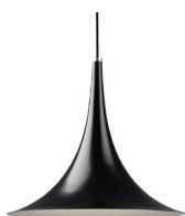
Trion 45 P1